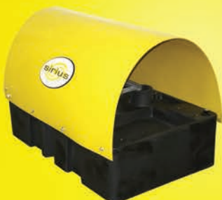
SIRIUS STEALTH BARREL STAND