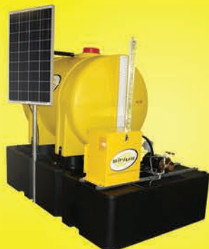
SIS STEALTH MOUNTED W/SIRIUS INJECTION PUMP