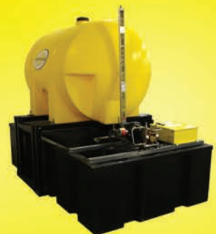
500G NOVA TANK *Shown with injection system