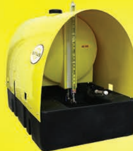
STEALTH TANK W/ HARDTOPPER